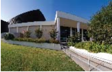
Civic Center (F4) 1100 N. 6th 325-676-6211

Book your next event at this outstanding cultural complex!