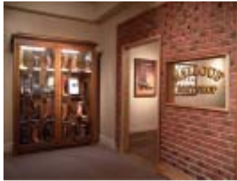
The authentic 1940s era Mallouf Boot Shop highlights the craft of custom boots.

Tuesday - Saturday, 10 a.m. to 5 p.m. [Thursday, closes at 8 p.m.] Closed Sunday, Monday and Major Holidays $5—Adult; $4—Sr. Citizen, Student, Military; $3—Ages 4 to 12; Free—Ages 3 and younger; Free on Thurs., 5 to 8 p.m.