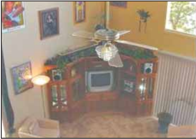
Willows 301/Horseshoe Bend: Four bedroom, three bath waterfront condo at the 1 mile marker.

If you are looking for amenities while enjoying the Lake of the Ozarks, look no further than our choice selection of condominiums. Our units come with a variety of added features including swimming pools, tennis courts, basketball facilities, children's playgrounds and boat slips. The units we represent are located in some of the best locations at the lake including the Horseshoe Bend area, the heart of Osage Beach and even inside the state park just off highway 42. These waterfront complexes offer great views and convenient locations, close to all the attractions, fine dining, the outlet mall, boat rentals and much more.