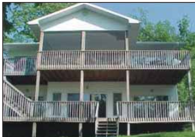
Oak Terrace/North Shore: Four bedroom, three and a half bath waterfront home at the 3 mile marker.

Looking for a home on the water complete with a private dock, big screen TV, close to town and with a great view of the lake? You've come to the right place. Al Elam has the largest assortment of waterfront vacation homes at the Lake of the Ozarks,