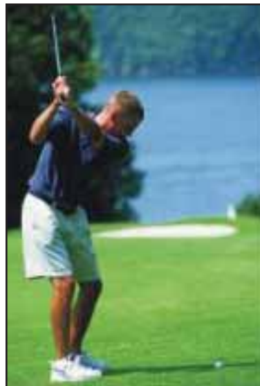
The Midwest's Golf Destination

In addition to our wealth of knowledge we provide good, old fashion customer service. You get to speak to real people who can give you real answers to your questions. If we don't know the answer we will track it down and call you back. We believe in building relationships, not just taking reservations, which is why 40 percent of our business each year is made up of returning guests. We think that says a lot about our service and our commitment to our guests.