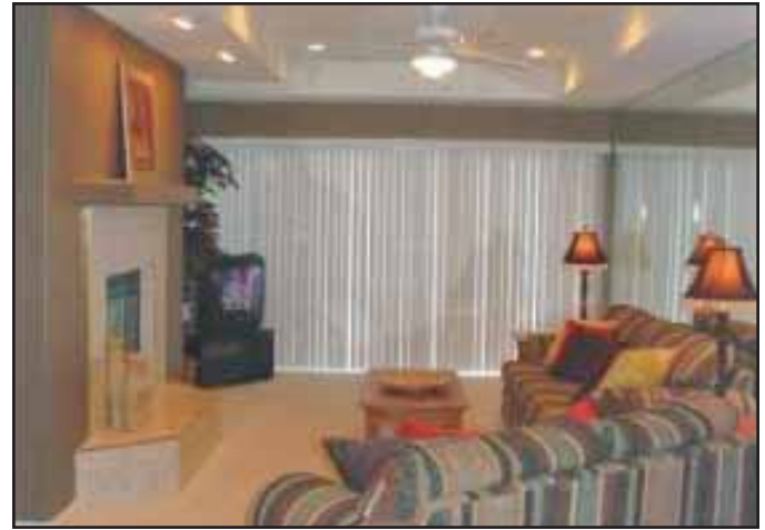
Emerald Bay 256-2C/Horseshoe Bend: Two bedroom, two bath waterfront condo at the 14 mile marker.

Relax at the pool overlooking the water, enjoy a game of tennis, shoot some hoops or just sit back and watch the variety of boats cruising up and down the lake. In the evening you can save money by cooking in the fully equipped kitchen or bar-b-que out on the gas grill. Our units are also equipped with cable or satellite TV and dvd players. Also all of our properties have a washer & dryer with the exception of our one bedroom units. So relax in a waterfront condo as you enjoy your very own Home At The Lake!