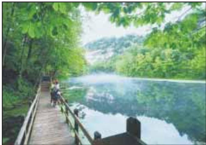
Ha Ha Tonka State Park

Al Elam Property Management and Vacation Rentals has a staff with over 60 years of experience of living at the lake. Our vacation coordinators are ready to assist you with any information or questions that you might have concerning the Lake of the Ozarks. This includes the best places to eat, where to rent a boat or jet ski, the best bargains, where to golf and just about anything else that you can think of when it comes to the Lake.