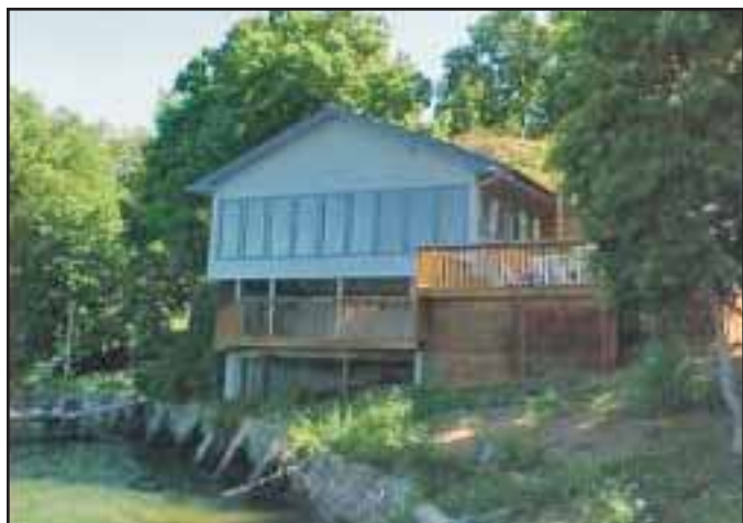
Smith Ozark Island #1/Horseshoe Bend: Four bedroom, three and a half bath waterfront home at the 10 mile marker.