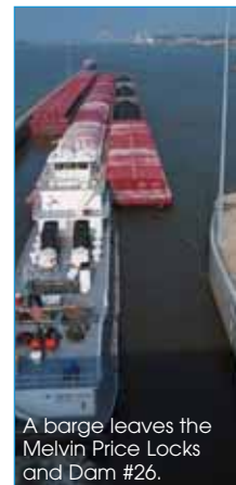
A barge leaves the Melvin Price Locks and Dam #26.

Visitors are also invited to see the river from a whole new perspective eight stories in the air from atop the Locks & Dam.