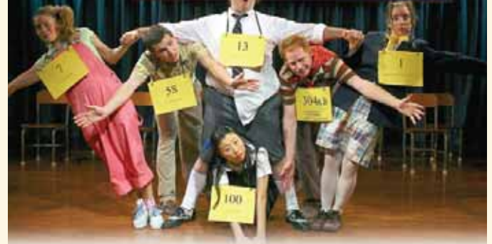
25th Annual Putnam County Spelling Bee, Barrington Stage Company

Click here for a complete listing of scenic views in The Berkshires Official Visitors Guide.