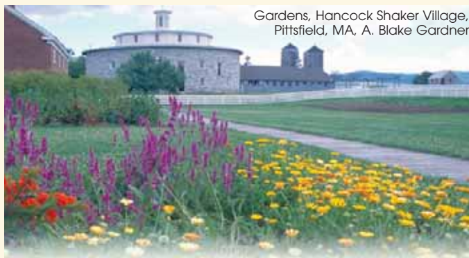
Gardens, Hancock Shaker Village, Pittsfield, MA