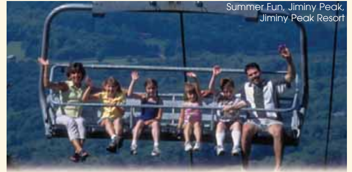
Summer Fun, Jiminy Peak, Jiminy Peak Resort

Click here for a complete listing of Health Spas/Clubs & Retreats in The Berkshires Official Visitors Guide.