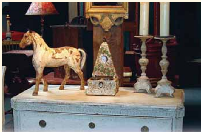
Antique dresser and horse, Berkshire County Antiques & Art Dealers Association