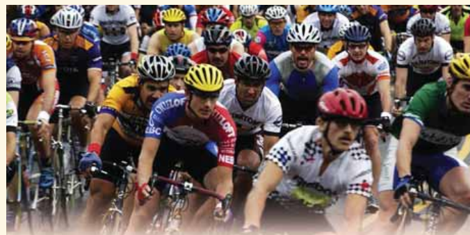
The Great Josh Billings Runaground, Lenox, MA

Click here for a complete listing of Gardens & Agriculture areas in The Berkshires Official Visitors Guide.