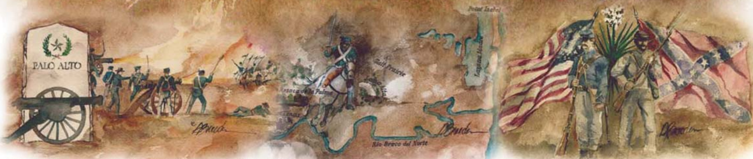
THE BATTLE of PALO ALTO The First Battle of The Mexican War