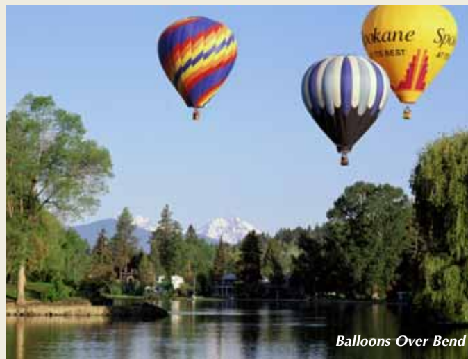
Balloons Over Bend

Central Oregon presents a year-round calendar of exciting events. Here, balloons splash color to the sky over downtown Bend's beautiful Drake Park during Balloons Over Bend in June.