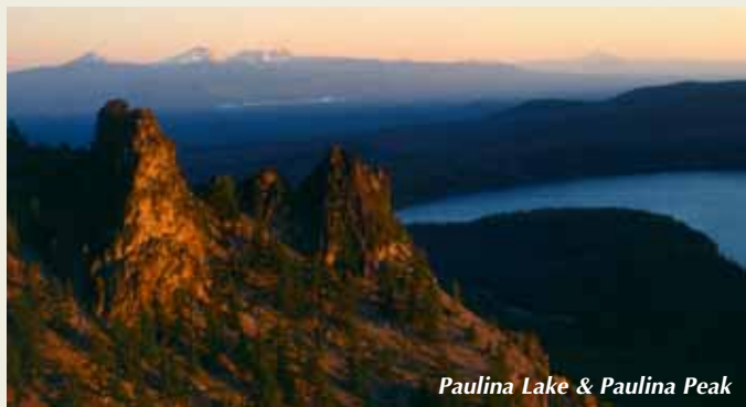
Paulina Lake & Paulina Peak

to enjoy Smith Rock for its scenic views, hiking and mountain biking trails, and wildlife viewing.