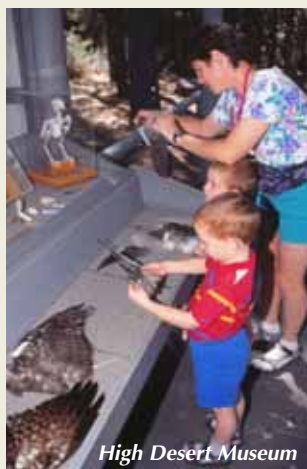
High Desert Museum

nationally acclaimed "living" museum explores the natural forces, historical events and cultural traditions that have shaped Central Oregon. This showplace facility incorporates live animals, a dynamic Birds of Prey exhibit, pioneer presentations, Western and Native American art, streamside exhibits, and walk-through-time dioramas.