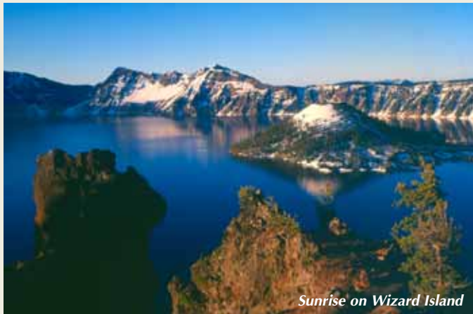
Sunrise on Wizard Island

Approximately 100 miles south of Bend, spectacular Crater Lake National Park is a popular day-trip from Central Oregon and is only a short drive away.