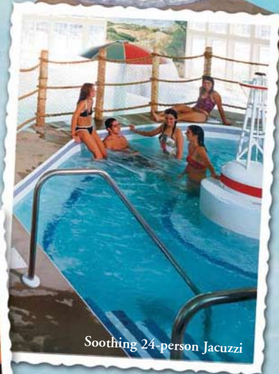
Soothing 24-person Jacuzzi

2 Nights for a Family of Four Includes up to $40 Meal Allowance Available Year-Round (888)297-2200 www.CapeCodderResort.com RESERVE ONLINE for guaranteed lowest rates