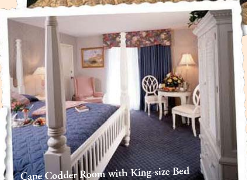
Cape Codder Room with King-size Bed