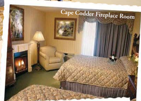
Cape Codder Fireplace Room

1 night in either a Loft Suite or Cape Codder Room Box of Chocolates upon arrival Dinner for two ($50 Dinner Allowance) • 2 Massages (888)297-2200 • www.CapeCodderResort.com Reserve Online for the guaranteed lowest rate!