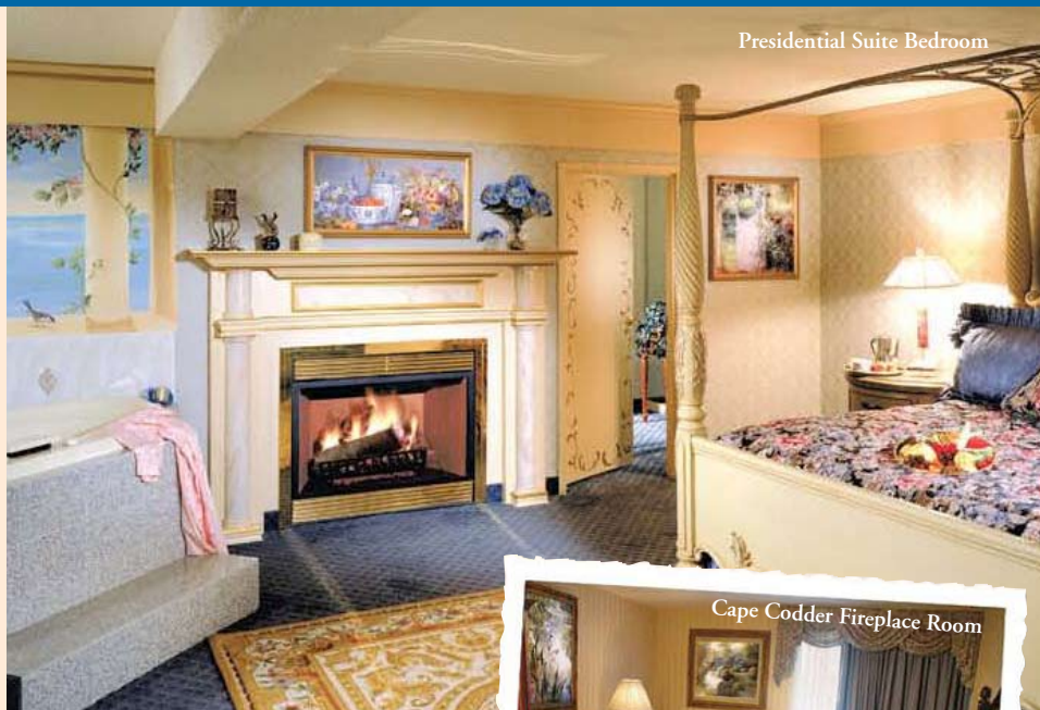
Presidential Suite Bedroom