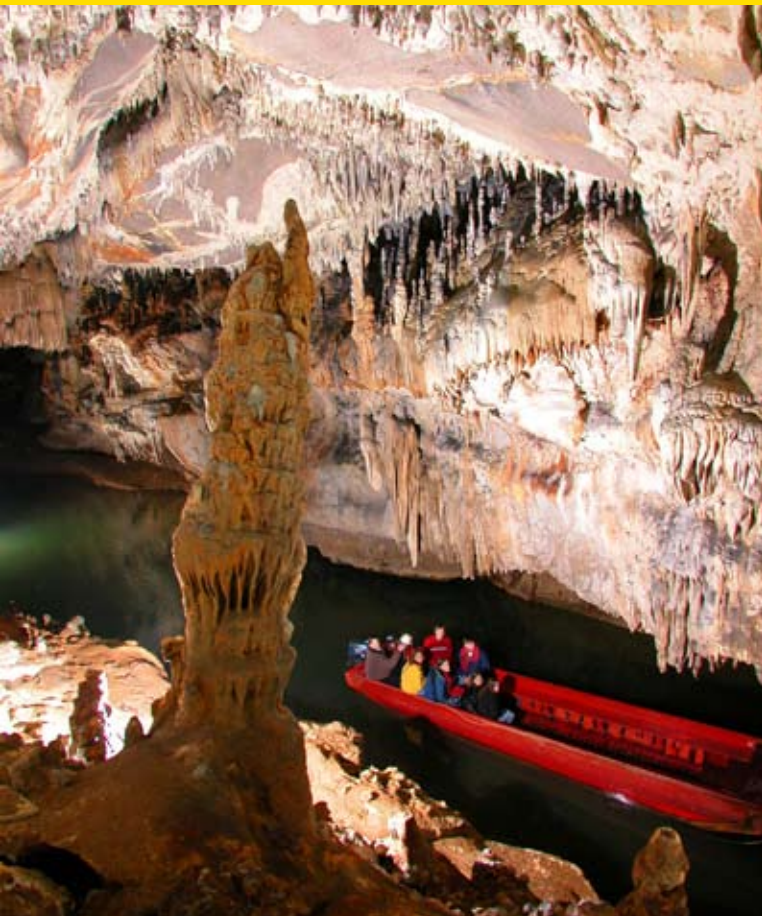
Statue of Liberty, Penns Cave