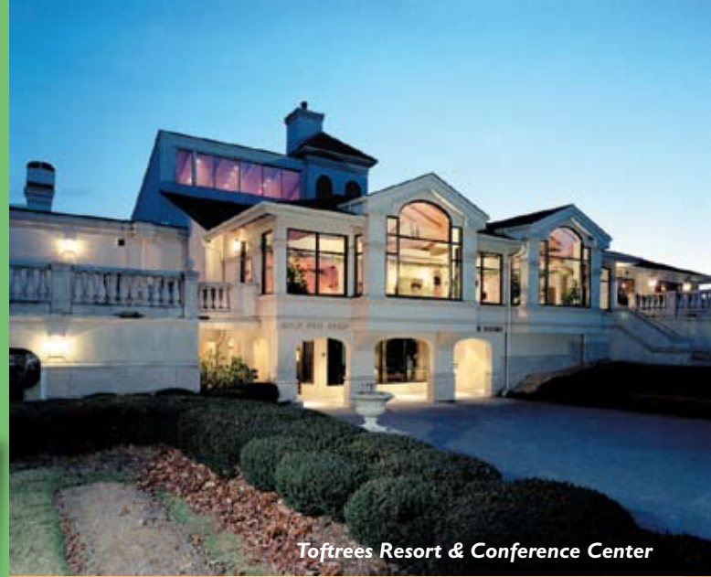
Toftrees Resort & Conference Center