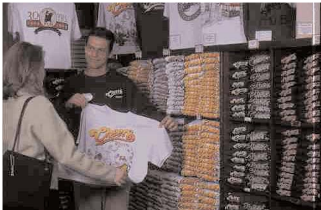
Choose from a variety of Cheers merchandise in our Gift Shops. For Mail Order, call 1-800-962-3333

Cap it off with an assortment of memorabilia and gifts that let you bring a bit of Cheers and Boston home with you. Gift shops are conveniently located at both Cheers bars.