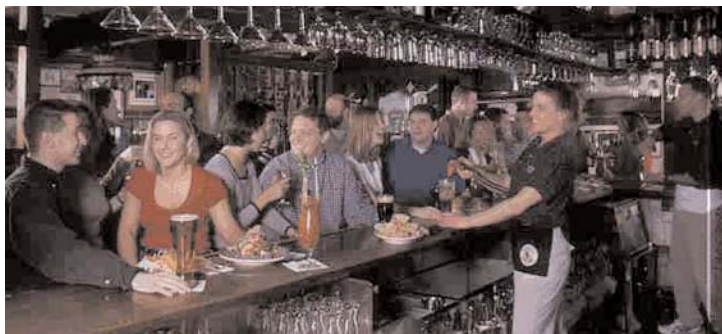
Join in the fun at Cheers Beacon Hill.

So how did a Boston pub become the inspiration for Cheers? When the producers of the TV show went looking for a location to depict the ideal American bar, they headed to Boston, famous for colorful pubs, sports teams, and lively politics. After visiting other Boston bars, they returned to the Bull & Finch and declared, “This is the place.” An American television classic was born, and they would name it Cheers. The TV show premiered on September 30, 1982, and remains one of America's most beloved situation comedies of all time.