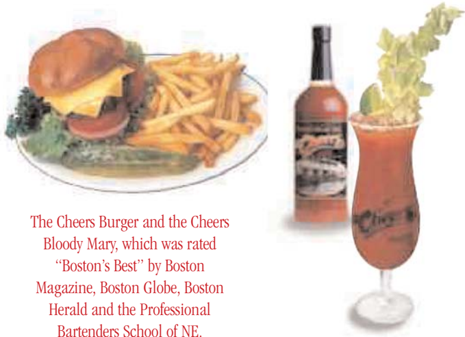
The Cheers Burger and the Cheers Bloody Mary, which was rated "Boston's Best" by Boston Magazine, Boston Globe, Boston Herald and the Professional Bartenders School of NE.

Our mouthwatering menu of traditional pub fare includes a delightful array of belly-filling favorites, such as New England clam chowder, juicy Cheers burgers, and a Boston favorite, fish & chips. Complementing the delicious menu is an abundant beverage selection, featuring our famous Cheers Bloody Mary and a selection of draft beers.