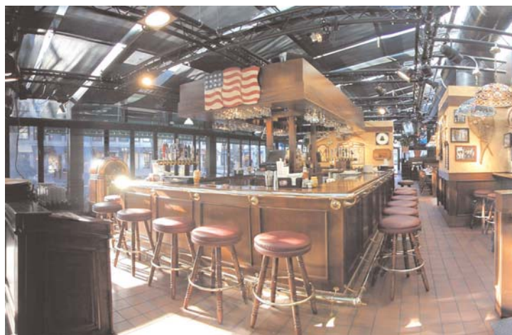
Come sit on Norm's seat at Cheers Faneuil Hall Marketplace.