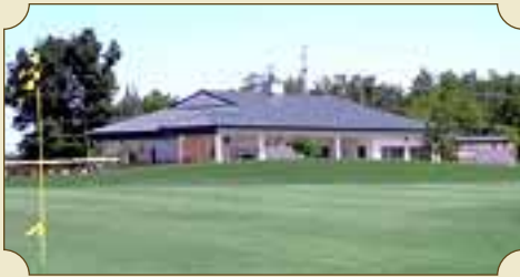
GREEN HILLS GOLF COURSE

Chillicothe is also home to a popular public golf course, Green Hills Golf Course , an 18-hole links-style course. The course first opened in 1993. There are four sets of tees to cater to all skill levels of golfers. The forward tees total 5,079 yards, the middle tees measure 6,042 yards, and the championship tees measure nearly 6,800 yards. The course features the classic links-style challenges – large sweeping greens, large mounds lining the fairways, tall native grass, and more than 30 sand traps. Weather permitting, the course operates all year around. Through hotel and golf packages with Chillicothe hotels and the short driving distance from Kansas City, St. Joe, Columbia, and Des Moines, the course attracts thousands of visitors to Chillicothe annually.