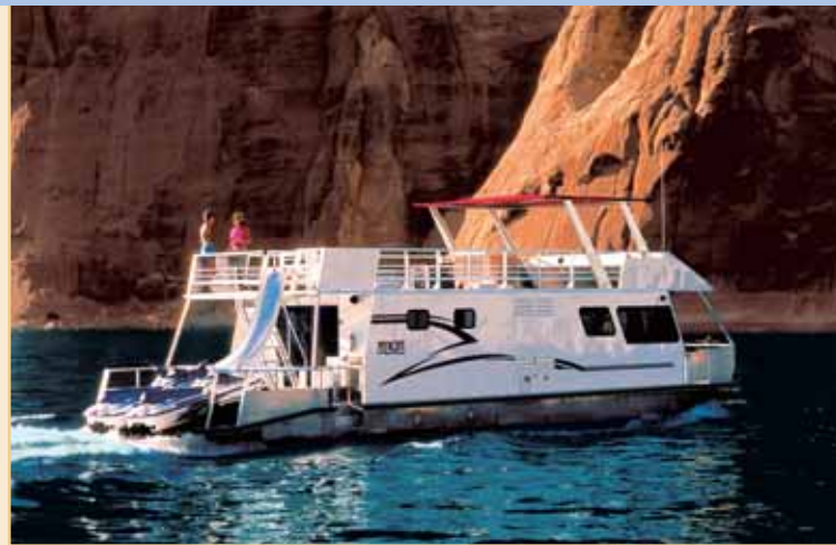
Our deluxe 54' Adventurer XL sleeps 12 and features two ramps for personal watercraft, water slide, CD stereo, and much more.

To claim that you've truly experienced Lake Powell for all it's worth, you must spend quality time floating upon its emerald-blue water, meandering through