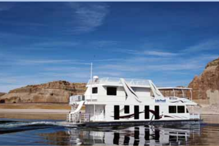
Our top-of-the-line 75' Odyssey sleeps 12 and features hot tub, fireplace, satellite TV, CD stereo, central heating and air, and much more.